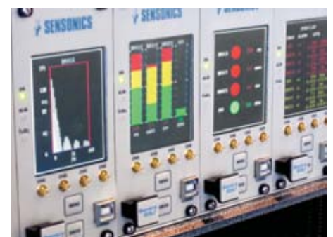
Sensonics' G3 machinery protection system displays

The four-channel G3 module is designed with an independent digital signal processor (DSP) for each channel of measurement. The DSP can be loaded with the specific measurement algorithm which not only controls the sensor selection but also the protection relay status and analogue output levels. Complete hardware autonomy is thus provided from sensor through to the protection relay combined with high channel density (24 channels in a 3U format). MP