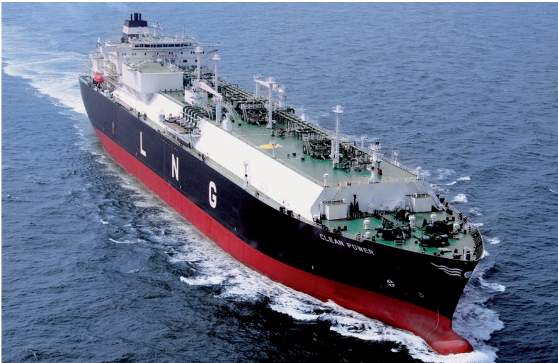
Clean Power – one of the three Dynagas ships awarded the turbine condition monitoring class notation

Steam turbine-powered LNGCs without a TCM notation are required to have their steam turbine top casings lifted at their five-year inspections to enable an examination of the rotors and diaphragms by class society surveyors. Amongst other things, having to lift the turbine top casings creates a risk that such an inspection can introduce a new set of turbine problems.